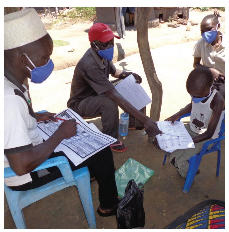
Uwezo volunteers trialing the ICAN tool with a child in a refugee settlement.

Project Awaaz aims to promote inclusive education in the Global South through evidence-informed advocacy by transnational alliances and citizen agency in 10+ PAL Network countries.